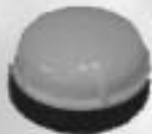
NEW GPS/WAAS Receiver Antenna

New LOW PRICE with small brightbar and GPS/ WAAS receiver